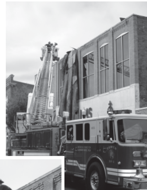
Cambridge firemen lower LMS center's dangling rubber roof safely to ground after Hurricane Irene wind damage.

"We're hoping our insurance will cover much of the repair," said Rev. David Maack, "but I'm sure there will be many costs remaining."