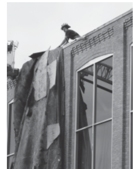
The center also experienced water damage.