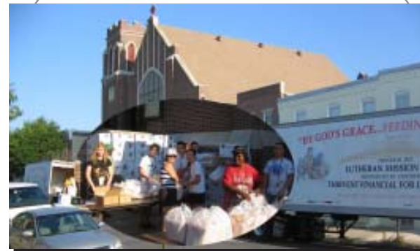
LMS "Caravan of Compassion" distributed 100,000 loaves of bread at 16 locations in 4 days. (Above: Volunteers at Amazing Grace in Baltimore prepare for bread distribution July 22, 2010)

Jesus declared, "I am the bread of life. Whoever comes to me will never go hungry, and whoever believes in me will never be thirsty. John 6:35"